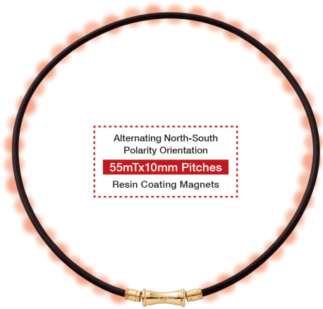
Magnet arrangement image