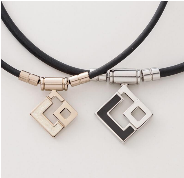
Comparison with “TAO Necklace AURA”

With all its lightness, the resin-coated magnet thread is magnetized to 55mT at 10-mm pitches throughout the neck loop to improve circulation and relieve stiffness over a large area through the power of the magnets. This magnetic necklace is perfect for women who want to look fashionable while alleviating their neck and shoulder pain.