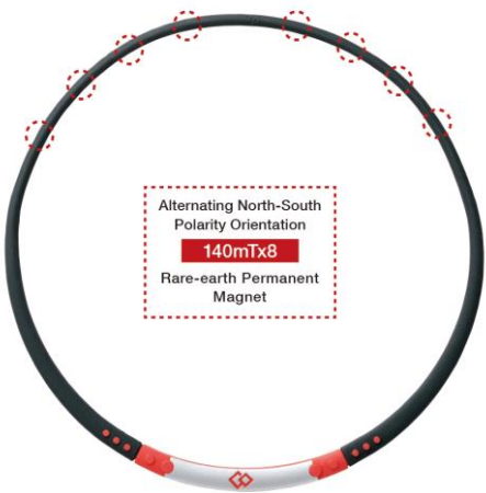
Magnet arrangement image