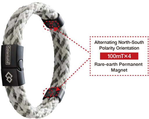
Magnet arrangement image