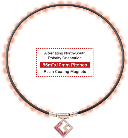
Magnet arrangement image