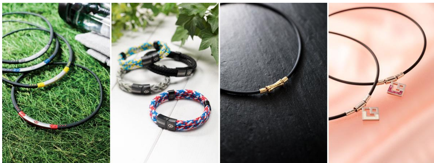
Images of “Wacle Neck SPORT”, “Colantotte Loop AMU”, “Colantotte TAO Necklace RAFFI Premium Gold” and “Colantotte TAO Necklace Slim Aura mini” from the left.

The new items include the “Wacle Neck SPORT,” a waterproof magnetic necklace for use during sports activities, and the “Colantotte Loop AMU,” a braided magnetic bracelet that feels pleasant against the skin. In addition, the popular Colantotte TAO Series is adding a new color, “Colantotte TAO Necklace RAFFI Premium Gold,” to its lineup, and for women, it is also adding the “Colantotte TAO Necklace Slim Aura mini,” which features a slim loop design.