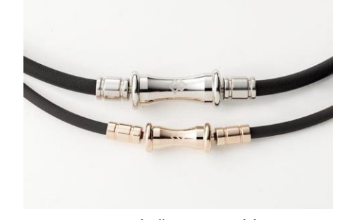
Comparison with "TAO Necklace RAFFI"

The simple, refined design is perfect for both casual wear and special occasions. It can also be used in combination with the "TAO Necklace RAFFI," which is currently available.