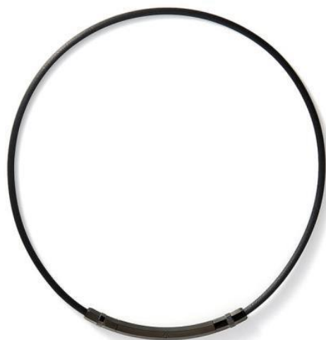
TAO Necklace Slim ARIE Black