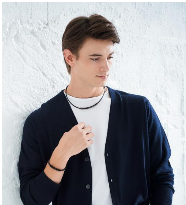
Black color worn image