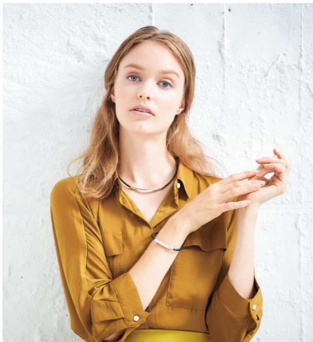
Silver color worn image

circulation of the entire neck region to alleviate stiffness. Three sizes are made available for a flexible selection of sizes for both males and females and can also be worn as paired accessories. The impression is casually chic when worn by men, while sophisticated when worn by women. The product is available in two color variations, the brilliant silver and the chic black. They are naturally suitable for daily use but can also be utilized in business scenes.