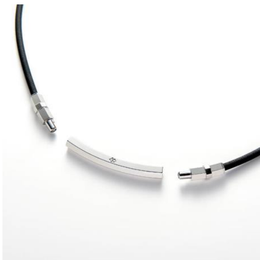
TAO Necklace Slim ARIE Joint Part