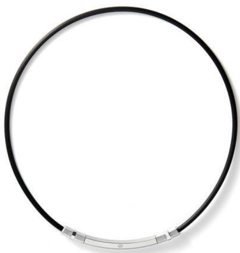
TAO Necklace Slim ARIE Silver