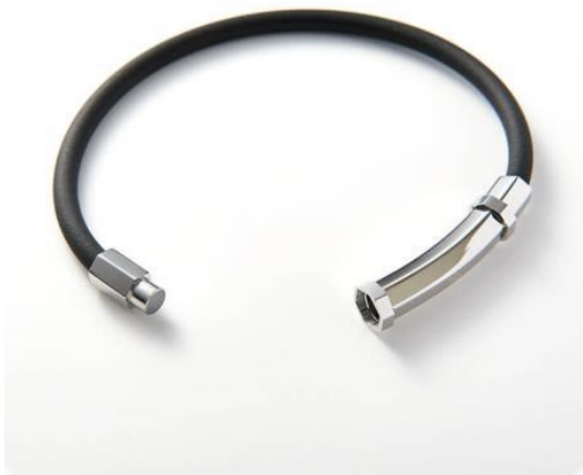
TAO Loop ARIE Joint Part