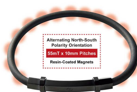
TAO Loop ARIE Magnetic Arrangement Diagram