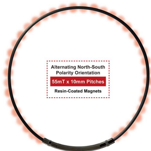
TAO Necklace Slim ARIE Magnetic Arrangement Diagram