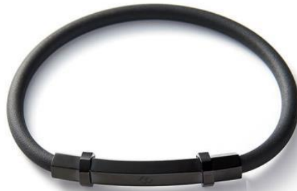
TAO Loop ARIE Black