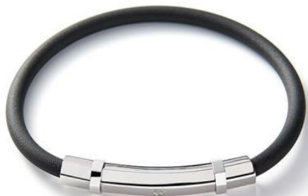
TAO Loop ARIE Silver