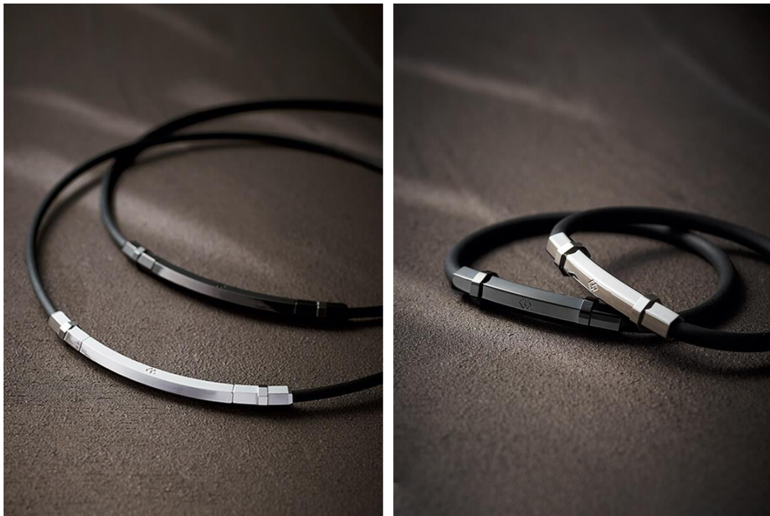
From left to right in the photograph: “Colantotte TAO Necklace Slim ARIE”, “Colantotte TAO Loop ARIE”