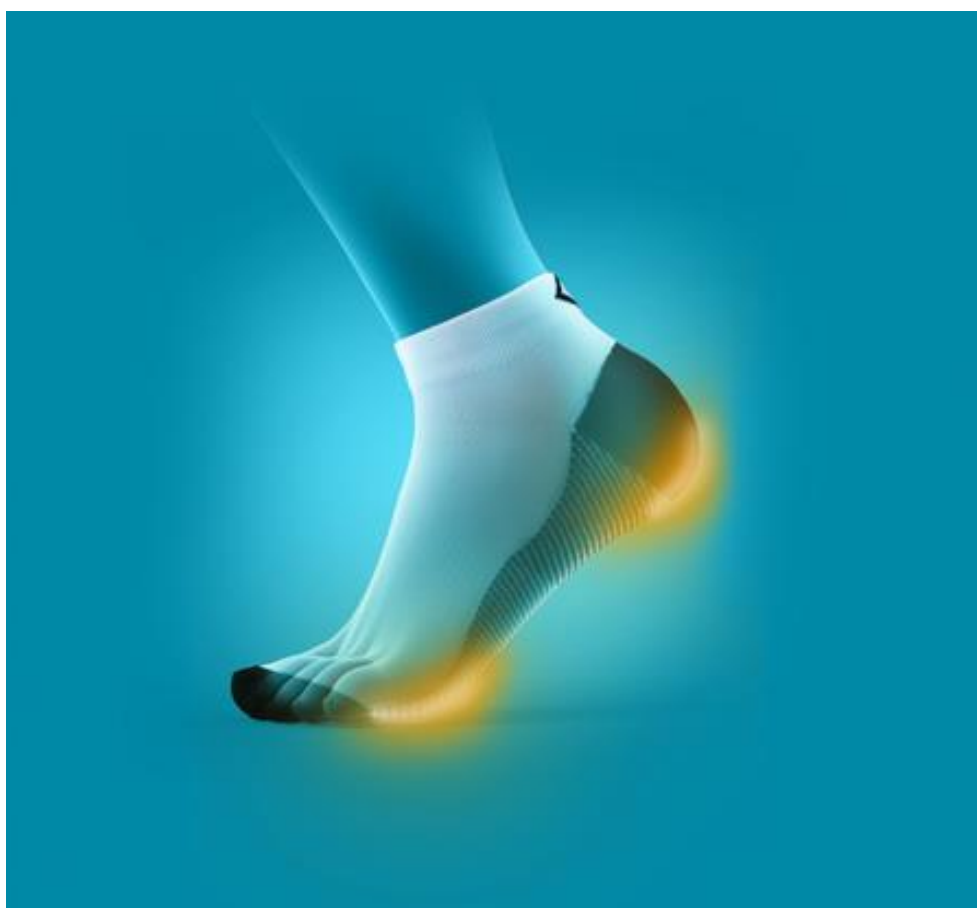
Colantotte RESNO Pro-Aid Socks [for Run]