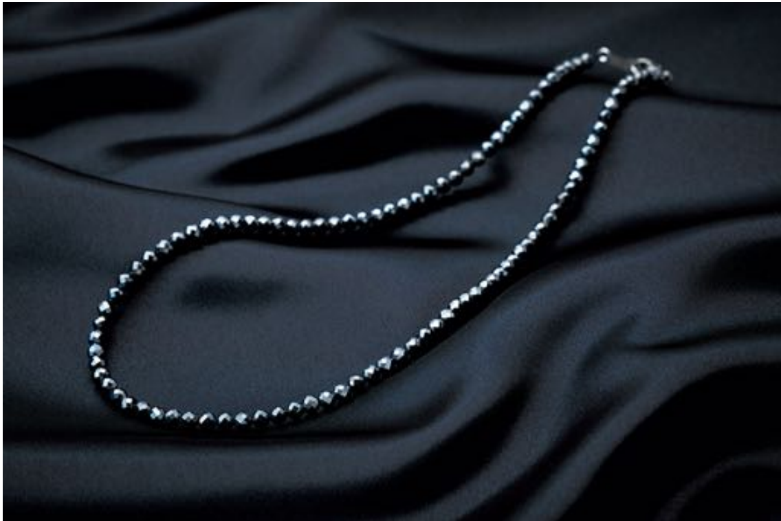
Colantotte Necklace LUCE α