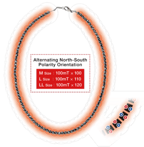
Magnet layout diagram